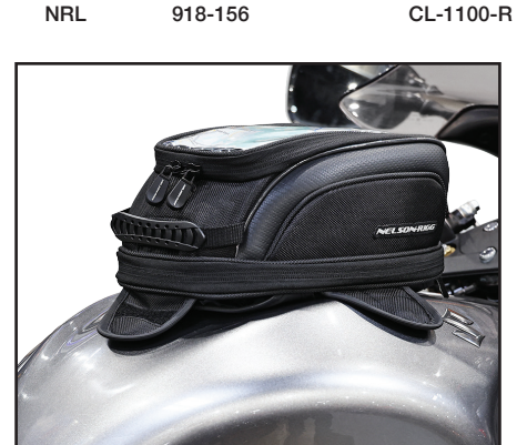
4-SHIELDED MAGNETS MOUTN SYSTEM

• Dimensions: 10.5" L x 7.5"W x 4.5"H 5.8 Liters Expanded dimensions: 10.5"L x 7.5"W x 6.5"H 8.4 Liters