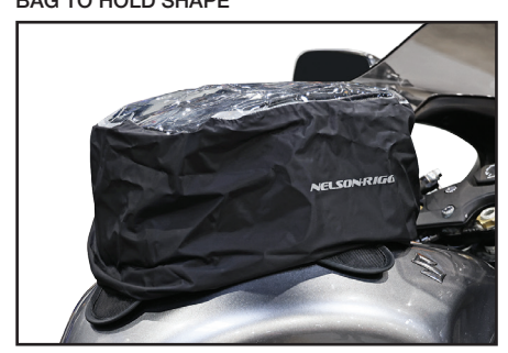
100% WATERPROOF RAIN COVER INCLUDED