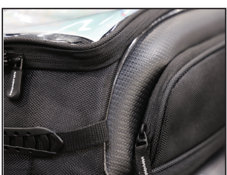
MOLDED EVA "CARBON-LIKE" PANELS ALLOW BAG TO HOLD SHAPE